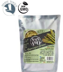
16007 Asparagus Spread